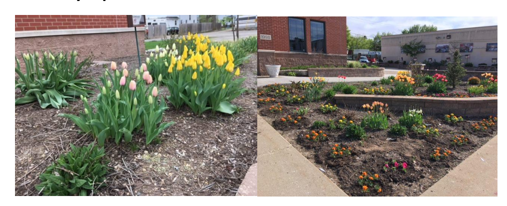
Screen-free Week winner: